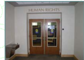
Department of Human Rights