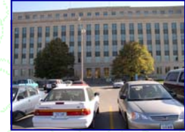
Lucas State Office Building